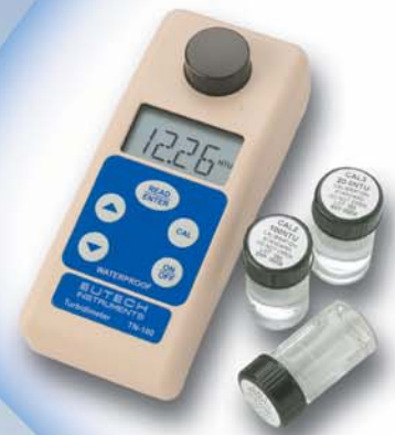
Waterproof TN100 Turbidimeter